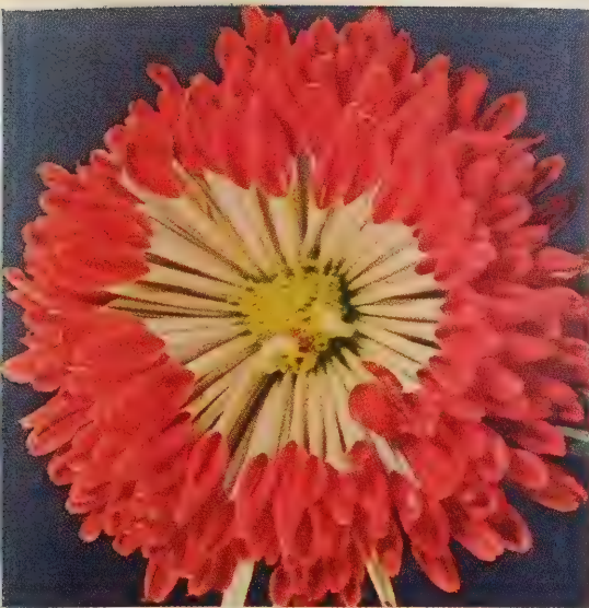
RUBY SPOON. 60c each; 3 for $1.50